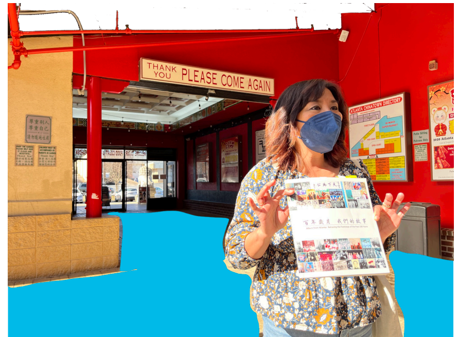
We Love Buford Highway site visit

We want the communities in the Atlanta region that have been historically and systematically marginalized and excluded to be supported as partners and co-creators in the planning process to express and fulfill their ideas and desires through THEIR OWN social, artistic, and cultural practices.