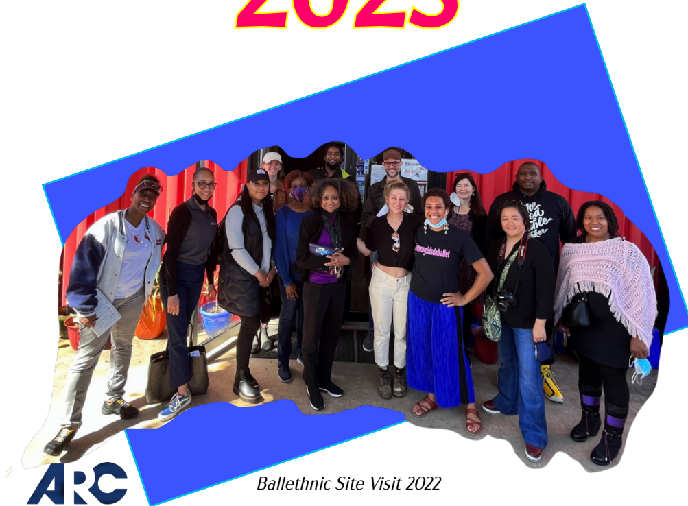
Ballethnic Site Visit 2022