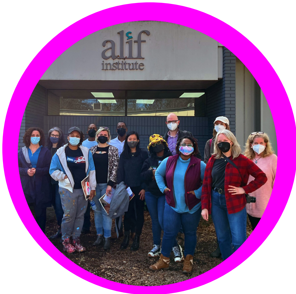
Alif Institute Site Visit 2022

The Culture and Community Design Class is a chance to dream , collaborate , and support community based organizations serving underrepresented populations in metro Atlanta in design projects and planning initiatives!